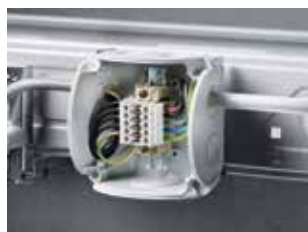
with terminal blocks