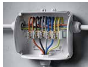
with Main line branch terminals