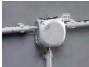
for copper conductors