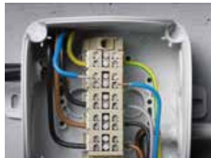
for aluminium and copper conductors