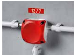
for safety lighting circuits