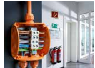
for intrinsic fire resistance and insulation integrity